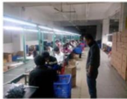
Finished product assembly